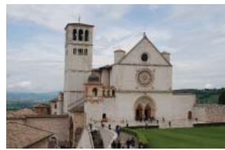
Basilica of St. Francis, Assisi

Francis of Assisi was born into wealth, was naturally a happy person, and others were drawn to him. As he grew up, he became a dreamer who sought glory, nobility and the prestige. But God's plan was different. God visited Francis in a dream and called him to reform.