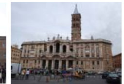
St. Mary Major