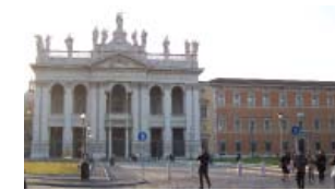
St. John Lateran

Early today, we proceed to St. Peter's Square for the Papal Audience (provided our Holy Father is home). We listen to the words of His Holiness Pope Francis and receive his blessing with pilgrims from all over the world. After the audience, we travel 40 miles south to Nettuno, where we learn more about the young Maria Goretti. Her life and death were focused intensely on defending her chastity, protecting her assailant from grave sin, and ultimately learning forgiveness. We visit the Basilica of Our Lady of Graces and Saint Maria Goretti , location of the relics of her body encased in wax. We also visit the farmhouse where she lived and died. We return to Rome for dinner and overnight. [B,D]